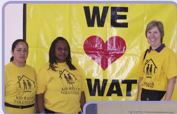
USC KidWatch (above) and USC School of Dentistry (right) provided support and services to event attendees.