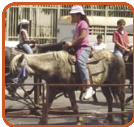
Children enjoy pony rides.

standing community partners provided access to their resources and services: USC School of Dentistry's mobile unit provided 105 free examinations; Department of Health Services provided Healthy Families and Medi-Cal information and enrollments; PACE Head Start successfully enrolled 30 children in its preschool programming; USC Kid Watch and California Highway Patrol informed families about safety resources; and Figueroa Corridor Association, El Clasificado , and USC Explorers provided volunteers to help staff the event.